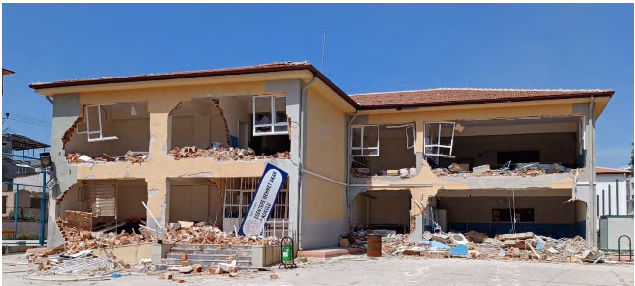
Fig. 11. Out of plane collapse of the infill walls on both floors.