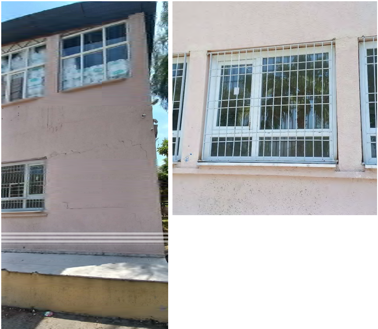
Fig. 13: Light damage at the interface of the infill walls