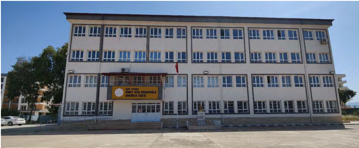
Fig. 2. -. Front view of the building.

The building was classified as moderately damaged, and was temporarily closed to scholastic activities, due to flexural cracks observed on beams of the frames in the longitudinal direction, such as the one shown in Fig. 3 with a crack width of 0.5 millimeters. The building avails of a strengthening system composed by additional RC shear walls, placed near the central part and spanning the entire height of the building