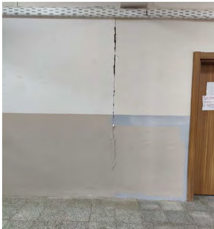
Fig. 5 – Separation of the masonry infill.