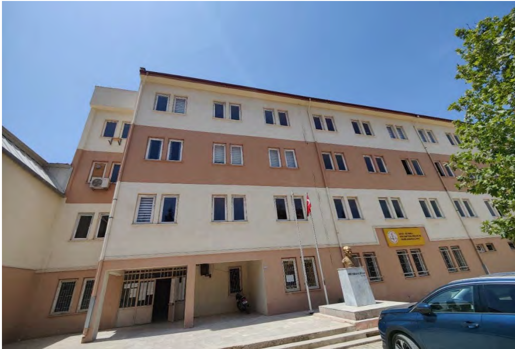
Fig. 4 Front view of the building