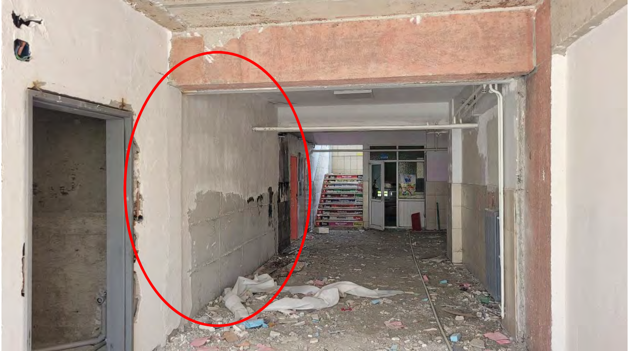
Fig. 14: Additional RC shear wall.

Ongoing retrofit operations that were not completed by the time of the earthquake.