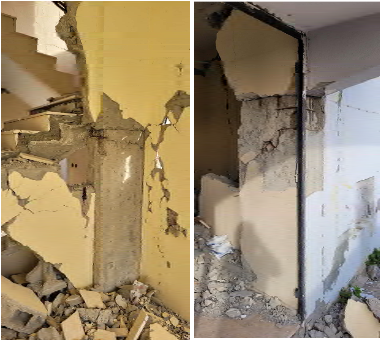
Fig. 15: Column damage

In the city of Erzin some column damage was observed near the staircase of an RC terrace.