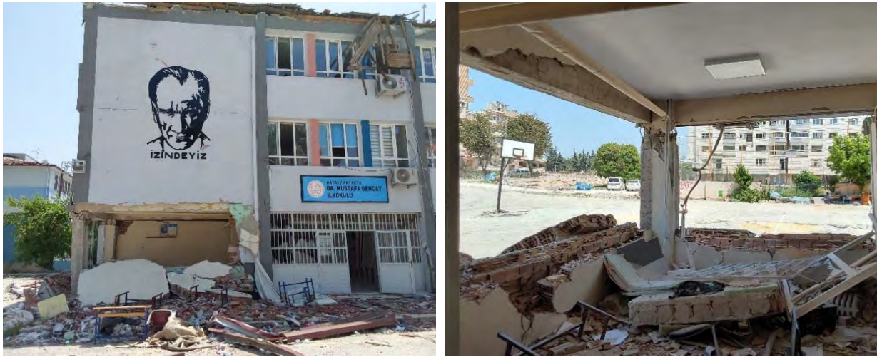
Fig. 8 Left panel: front view; right panel: view from the inside, collapsed external infill masonry walls and plastic hinging of the adjacent columns with clear disorganization of the concrete nucleus due to lack of adequate passive confinement