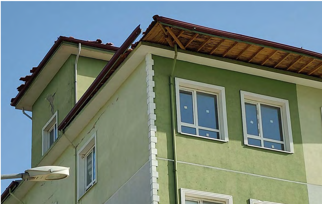
Fig. 7 – Partial collapse of the roof cover.

This building was closed to scholastic activities. It exhibits ubiquitous cracks on all sides, that only seem to concern the finishing mortar. The roof cover has evident damage, with part of it on the front side being displaced with some the roof tiles falling over.