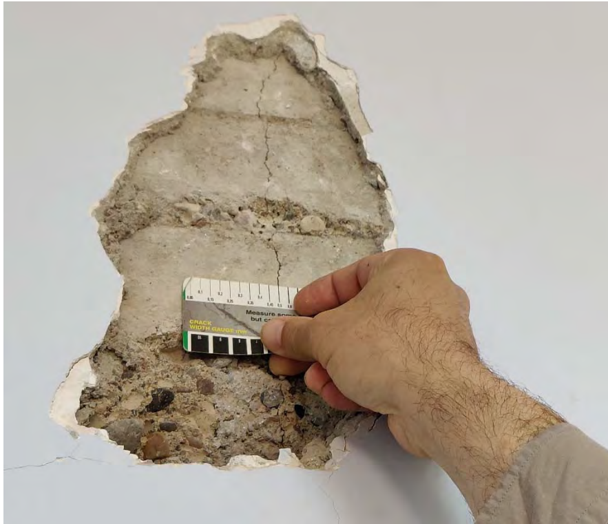
Fig. 3. - Position on a flexural crack on a beam.