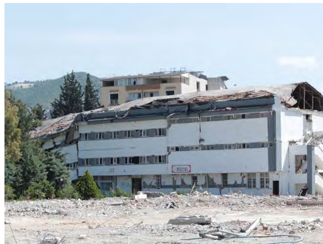
Fig. 17. Partial collapse of a large portion of a dormitory building, due to heavy damage of several consecutive columns at the ground floor.