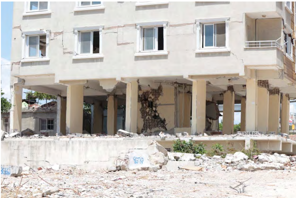
Fig. 16. Shear failure of an RC shear wall and plastic hinging at the top of the ground floor columns.

The following damage was observed in the city of Antioch (Antakya):