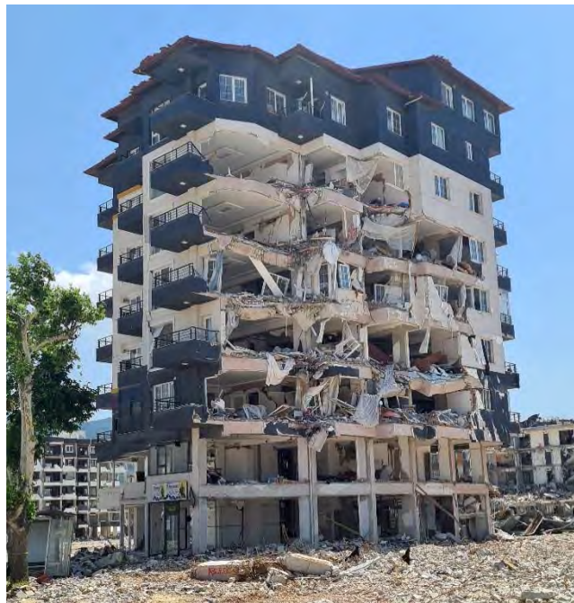
Fig. 18 Collapse of the external infill walls and damage to the perimeter beams lacking direct column support.

In the city of Atakoy, shear failure was observed in many RC columns in the vicinity of the stairwells