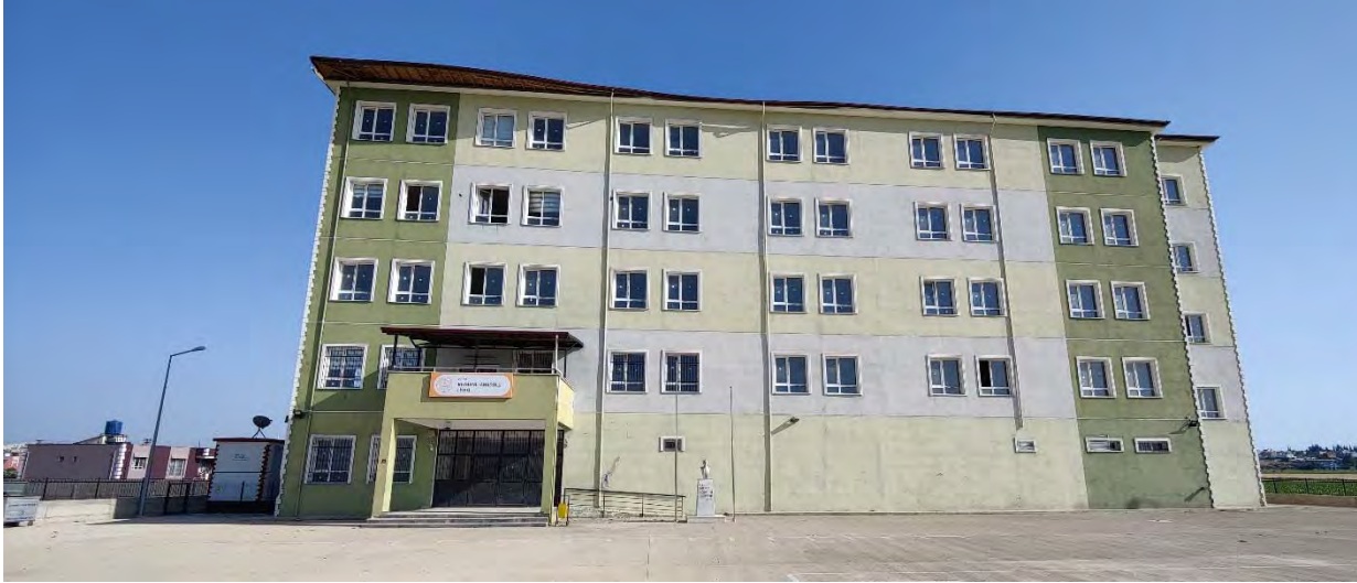
Fig. 6 – Front view of the building.