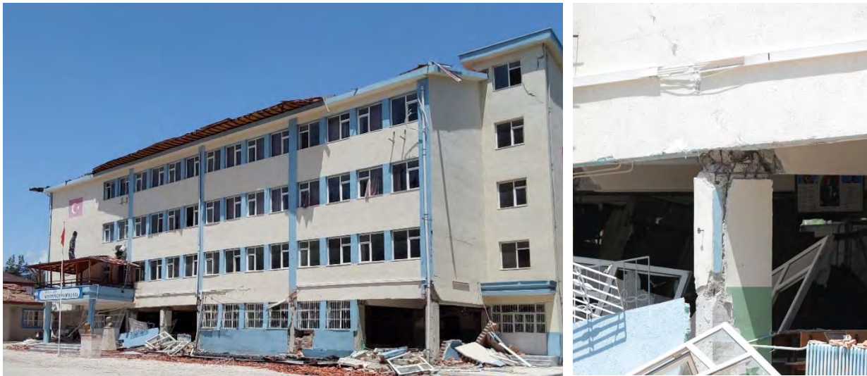
Fig. 9. Soft storey effect due to partial collapse of the front infill walls; plastic hinging of the columns.