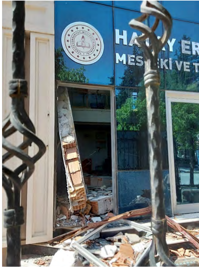
Fig. 12. Overturning of internal masonry separation walls