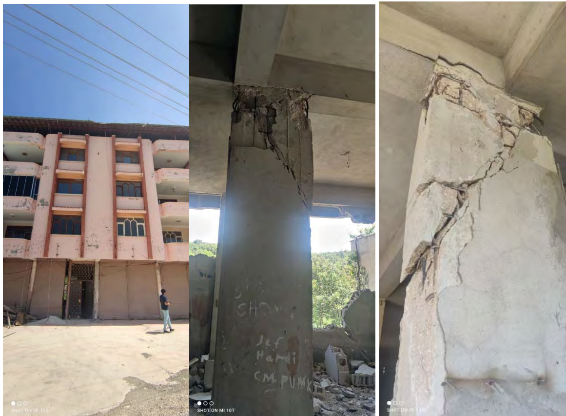
Fig. 19 Shear failure of several RC columns near the stairwells

In the city of Atakoy, shear failure was observed in many RC columns in the vicinity of the stairwells